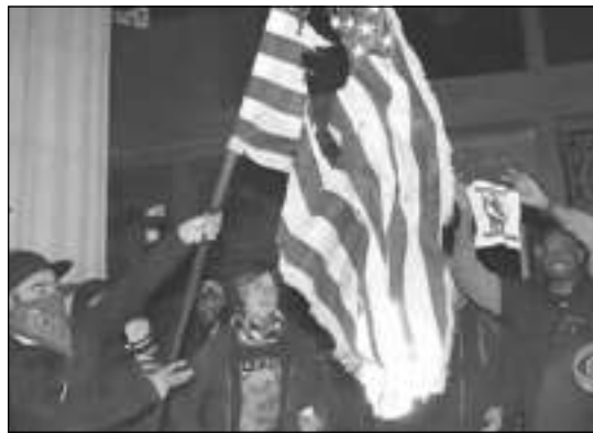
Oakland protesters burn U.S. flag

When you look at recent events in Oakland, where “occupy” protesters engaged in vandalism and battled with police you might wonder if the promotion of class envy, anger and class warfare is achieving its intended effect. Will the rhetoric of “income inequality” and the “inherent unfairness of capitalism” erupt in arson and